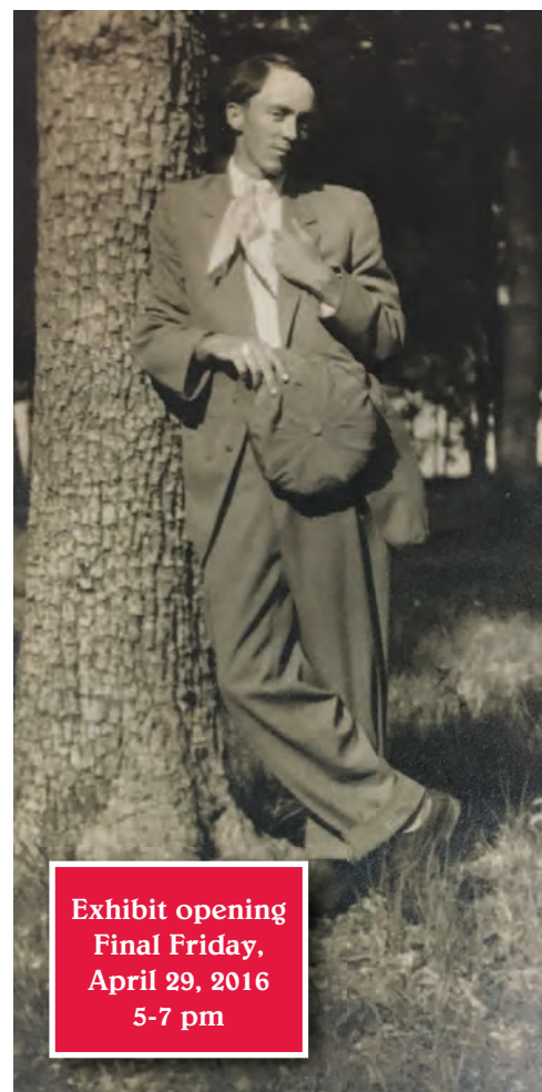
Exhibit opening Final Friday, April 29, 2016 5-7 pm