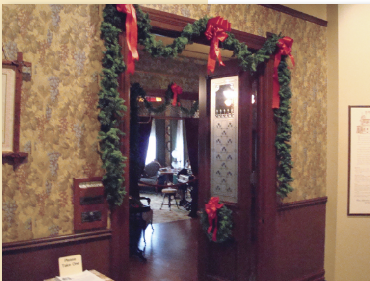
The Victorian Cottage welcomes guest for Christmas.