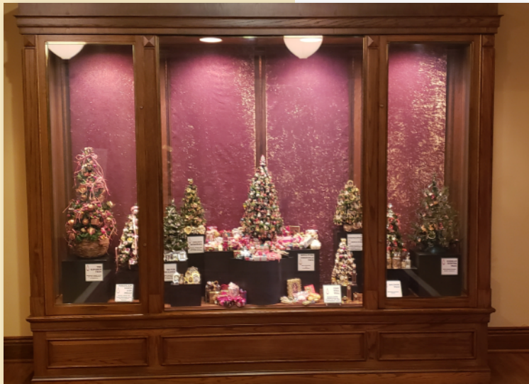
Miniature Christmas trees created by Sylvia Jackson.