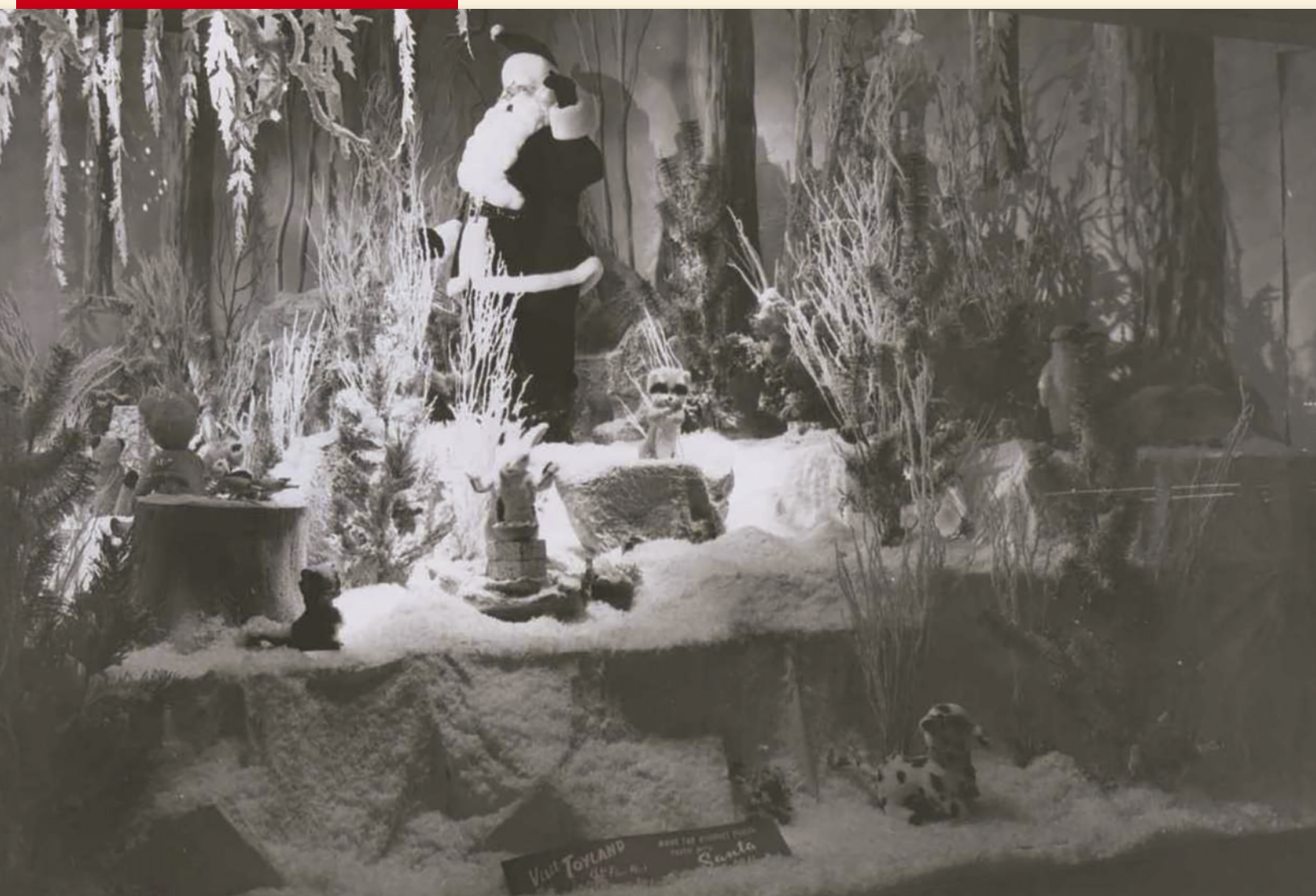
Macy's Department Store Christmas window circa 1960.