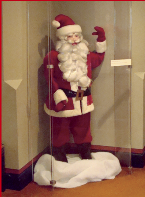
The original Santa that was the centerpiece of the Innes/Macy's window is now on display at the Historical Museum during the Christmas season.