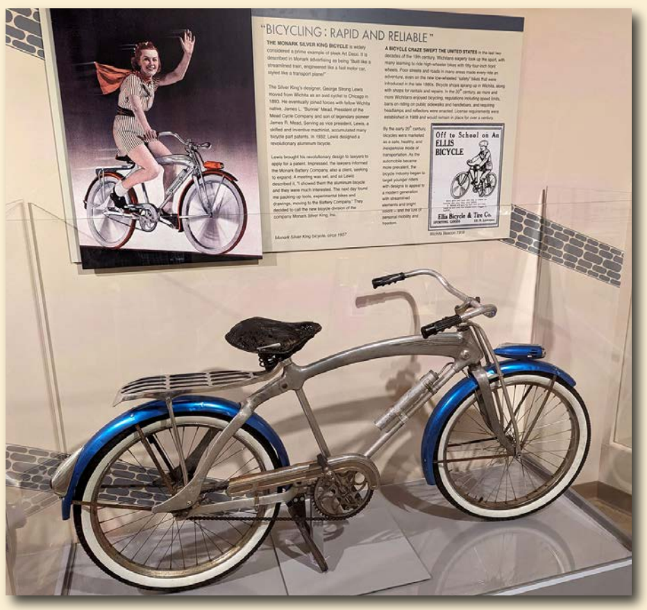
1939 Monarch Silver King Bicycle

he Museum explores our local story and serves as a sort of community family album. The fact that museums interpret artifacts in exhibits to serve as the medium for story telling sets museums apart from books, videos, and other media. The Historical Museum features two dozen exhibitions at any given time: immersive exhibits such as the Mayor's Office and the Wichita Cottage, traveling exhibits such as Small Expressions and Thrift Style, special exhibits like those found in the Museum's lobby and core exhibits such as Wichita, the Magic City and the Spirit of Wichita. The core exhibits are central to telling our story and are subject to reinterpretation, redesign, and the addition of artifacts from the Museum's collection. Maintaining core exhibits requires ongoing assessment, planning, and fund raising.